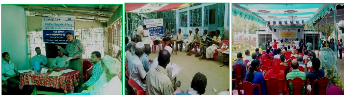
This Cold Chain Bangladesh Alliance (CCBA) Project and Objectives of the project is activities performed with CCBA comprised of four components with specific objectives. The components are as follows pictures.