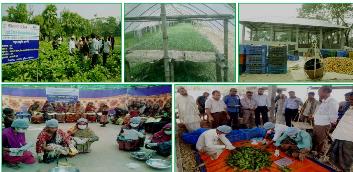
Funded by : USAID through Winrock International, USA, January 2015 to April 2016 Comilla & Sylhet (6 Upazila), Beneficiaries: 9000 farmers