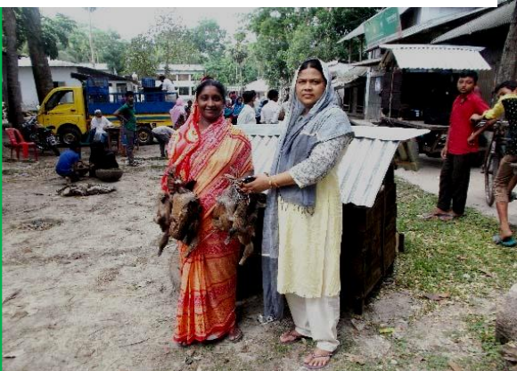
Funded by: Bangladesh NGO Foundation, July 2015 to June 2017, Nesarabad Upazila of Pirojpur district, Beneficiaries: 200 poor families. SMKK is implementing a project for income generation through rearing of local poultry birds.