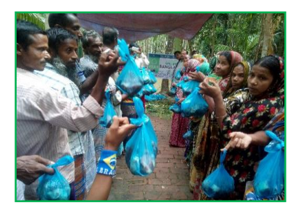
Funded by: Muslim Aid - UK & SAWAB, 2004 to On going project, Nesarabad Upazila of Pirojpur District, Beneficiary: 100 families.