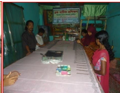
A total of 38,856 beneficiaries were trained on 23 courses under 5 sectors during the reporting year, out of which 36,698 were female and 2,158 were male .

For selection of training participants, a care selection process was followed, especially for the off-farm IGA. Physical facilities in operation of the selected trade, its market opportunity and financial capabilities are considered during the process of selection. These exercises have prevented misuse of resources and more than 85% trained beneficiaries have utilized their skills. Similar approaches also applied for other agricultural training.